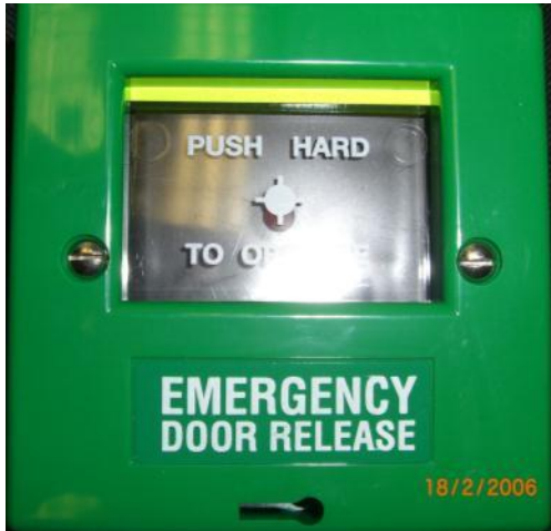
Break glass pushed (door released)